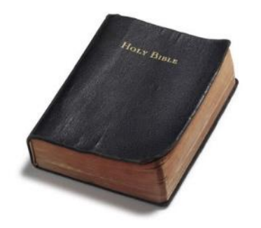
The Bible is the Word of God